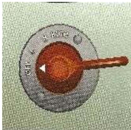
A rotary type magneto switch used in a Piper Cub

The dead cut and live mag checks are done at low rpm setting and should do no harm to the engine. Once the desired effect (continued running for dead cut, engine cutting for live mag) has been noted, however, proceed without undue delay to the next switch setting.